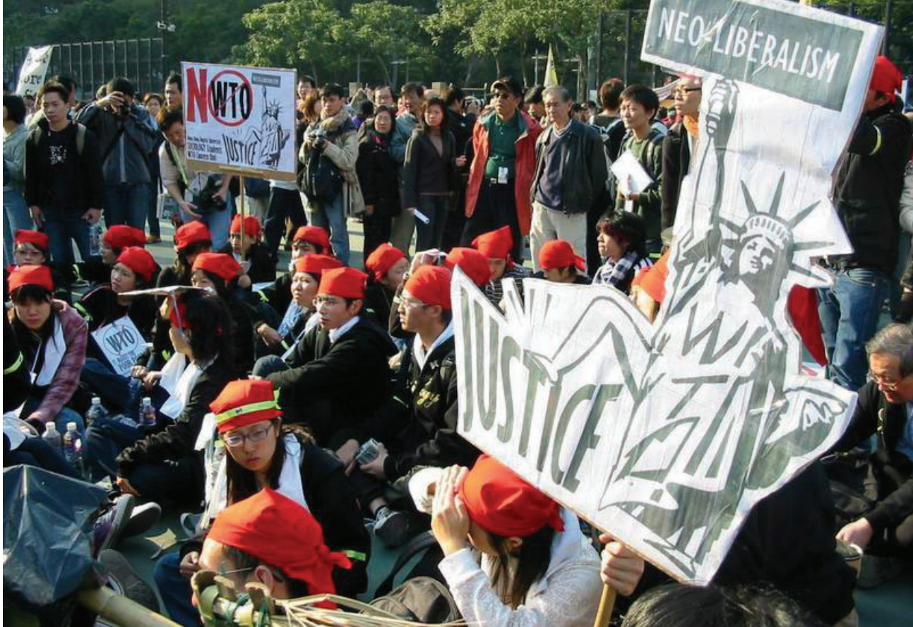
A demonstration against WTO in Hong Kong, 2005