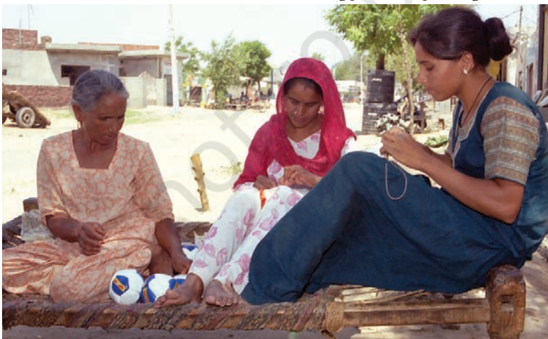
Women at home in Ludhiana making footballs for large MNCs

There's another way in which MNCs control production. Large MNCs in developed countries place orders for production with small producers. Garments, footwear, sports items are examples of industries where production is carried out by a large number of small producers around the world.