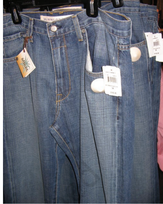
Jeans produced in developing countries being sold in USA for Rs 6500 ($145)

The products are supplied to the MNCs, which then sell these under their own brand names to the customers. These large MNCs have tremendous power to determine price, quality, delivery, and labour conditions for these distant producers.