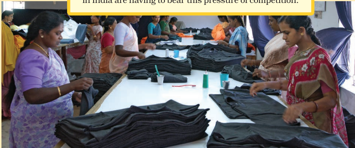
Factory workers folding garments for export. Though globalisation has created opportunities for paid work for women, the condition of employment shows that women are denied their fair share of benefits.

Let us see how the workers in the garment export industry in India are having to bear this pressure of competition.