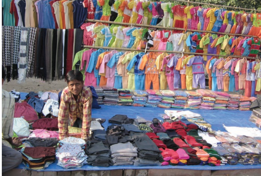
Small traders of readymade garments facing stiff competition from both the MNC brands and imports.

In general, with the opening of trade, goods travel from one market to another. Choice of goods in the markets rises. Prices of similar goods in the two markets tend to become equal. And, producers in the two countries now closely compete against each other even though they are separated by thousands of miles! Foreign trade thus results in connecting the markets or integration of markets in different countries.