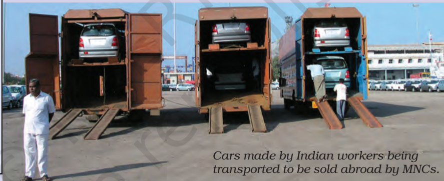
Cars made by Indian workers being transported to be sold abroad by MNCs.