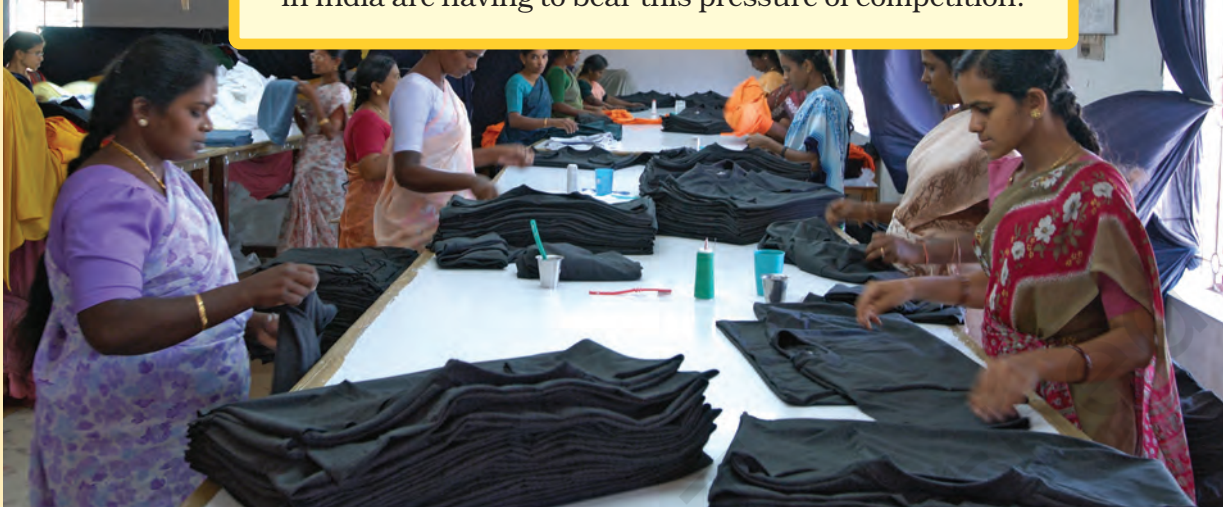
Factory workers folding garments for export. Though globalisation has created opportunities for paid work for women, the condition of employment shows that women are denied their fair share of benefits.

Let us see how the workers in the garment export industry in India are having to bear this pressure of competition.