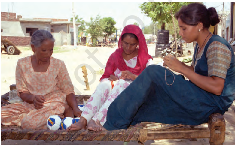
Women at home in Ludhiana making footballs for large MNCs

There's another way in which MNCs control production. Large MNCs in developed countries place orders for production with small producers. Garments, footwear, sports items are examples of industries where production is carried out by a large number of small producers around the world.