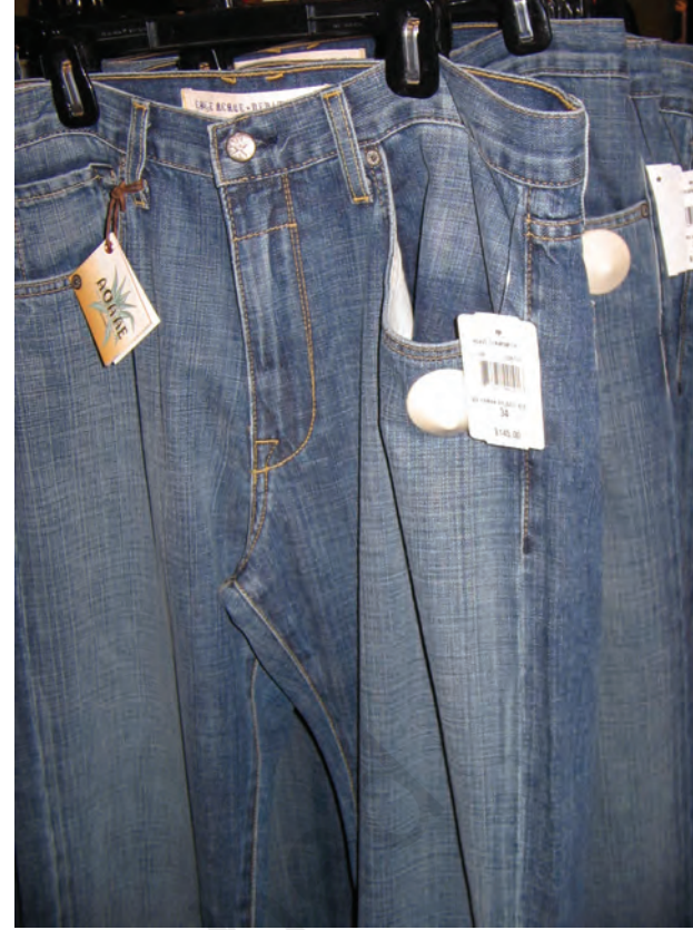
Jeans produced in developing countries being sold in USA for Rs 6500 ($145)

The products are supplied to the MNCs, which then sell these under their own brand names to the customers. These large MNCs have tremendous power to determine price, quality, delivery, and labour conditions for these distant producers.