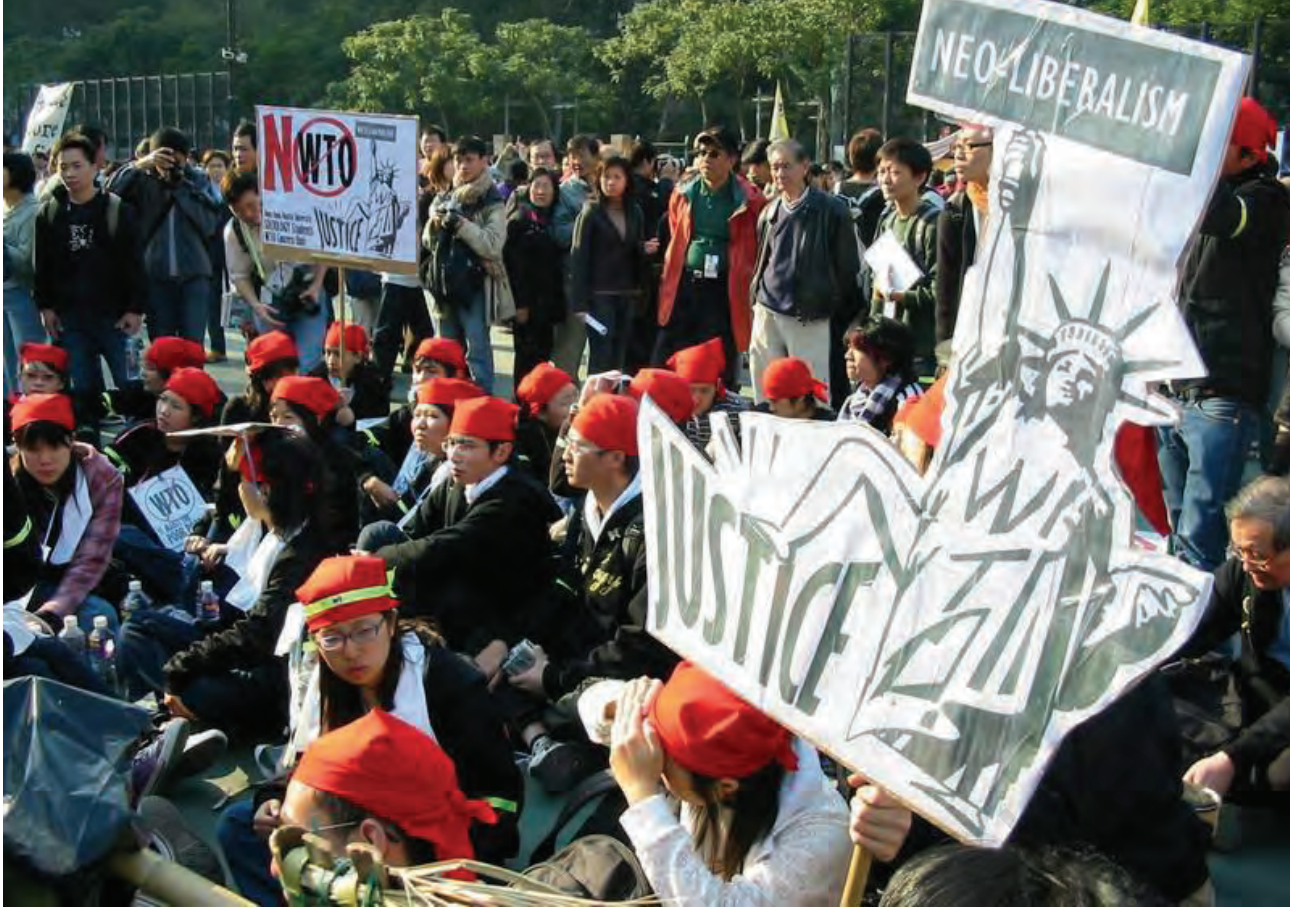
A demonstration against WTO in Hong Kong, 2005