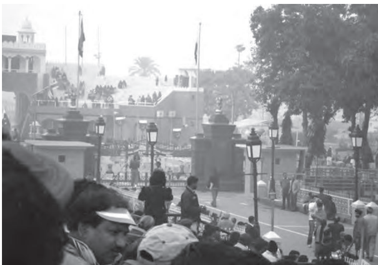
Fig. 8.1 Wagah Border is not only a tourist place but also used for trade between India and Pakistan

goods. At this stage, enterprises owned by government (known as State Owned Enterprises—SOEs), which we, in India, call public sector enterprises, were made to face competition. The reform process also involved dual pricing . This means fixing the prices in two ways; farmers and industrial units were required to buy and sell fixed quantities of inputs and outputs on the basis of prices fixed by the government and the rest were purchased and sold at market prices. Over the years, as production increased, the proportion of goods or inputs transacted in the market also increased. In order to attract foreign investors, special economic zones were set up.