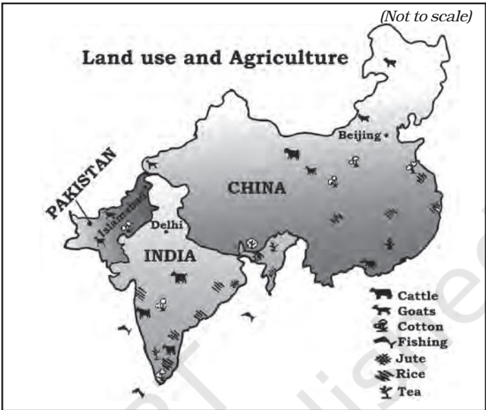
Fig. 8.2 Land use and agriculture in India, China and Pakistan

When many developed countries were finding it difficult to maintain a growth rate of even 5 per cent, China was able to maintain near double-digit growth during 1980s as can be seen from Table 8.2. Also, notice that in the 1980s, Pakistan was ahead of India; China was having double-digit growth and India was at the bottom. In 2015–17, there has been a decline in Pakistan