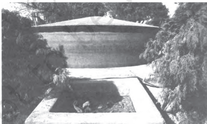
Fig.7.4 Gobar Gas Plant uses cattle dung to produce energy

Wind Power: In areas where speed of wind is usually high, wind mills can provide electricity without any adverse impact on the environment. Wind turbines move with the wind and electricity is generated. No doubt, the initial cost is high. But the benefits are such that the high cost gets easily absorbed.