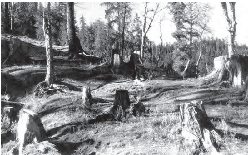
Fig. 7.3 Deforestation leads to land degradation, biodiversity loss and air pollution

India has abundant natural resources in terms of rich quality of soil , hundreds of rivers and tributaries , lush green forests , plenty of mineral deposits beneath the land surface, vast stretch of the Indian Ocean , ranges of mountains , etc. The black soil of the Deccan Plateau is particularly suitable for cultivation of cotton, leading to concentration of textile industries in this region. The Indo-Gangetic plains — spread from the Arabian Sea to the Bay of Bengal — are one of the most fertile, intensively cultivated and densely populated regions in the world. India's forests , though unevenly distributed, provide green cover for a majority of its population and natural cover for its wildlife. Large deposits of iron-ore , coal and natural gas are found in the country. India accounts for nearly 8 per cent of the world's total iron-ore reserves. Bauxite , copper , chromate , diamonds , gold , lead , lignite , manganese , zinc , uranium , etc. are also available in different parts of the country. However, the developmental activities in India have resulted in