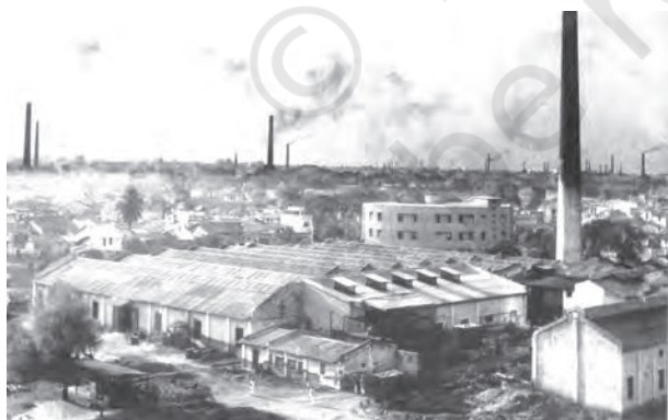
Fig. 7.2 Damodar Valley is one of India's most industrialised regions. Pollutants from the heavy industries along the banks of the Damodar river are converting it into an ecological disaster

environment and the rate of resource extraction was less than the rate of regeneration of these resources. Hence environmental problems did not arise.