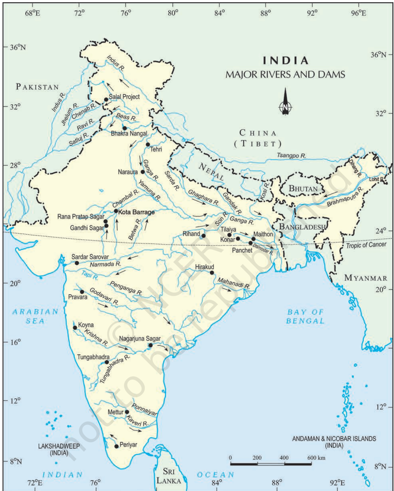
India: Major Rivers and Dams