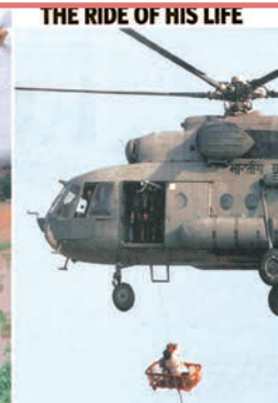
An IAF helicopter rescues a worker who was trapped in the floodwaters of the Tasi river in Jammu on Thursday