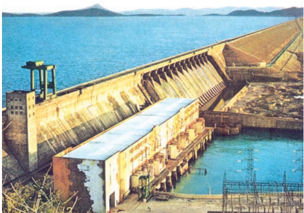
Fig. 3.2: Hirakud Dam

What are dams and how do they help us in conserving and managing water? Dams were traditionally built to impound rivers and rainwater that could be used later to irrigate agricultural fields. Today, dams are built not just for irrigation but for electricity generation, water supply for domestic and industrial uses, flood control, recreation, inland navigation and fish breeding. Hence, dams are now referred to as multi-purpose projects where the many uses of the impounded water are integrated with one another. For example, in the Sutluj-Beas river basin, the Bhakra – Nangal project water is being used both for hydel power production and irrigation. Similarly, the Hirakud project in the Mahanadi basin integrates conservation of water with flood control.