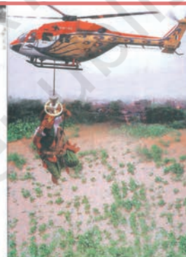
UP: UP S. ADITYA An IAF helicopter rescues a woman and her child from the Chonggaon village of Maharashtra's Kolhapur district. In all, 11 choppers were pressed into rescue operations across the state (Related reports on P)

Collect information about flood prone areas of the country