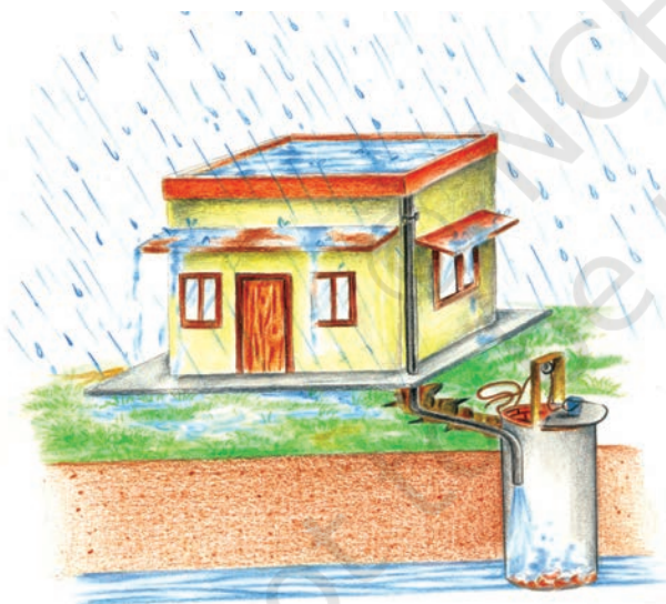
(b) Recharge through Abandoned Dugwell