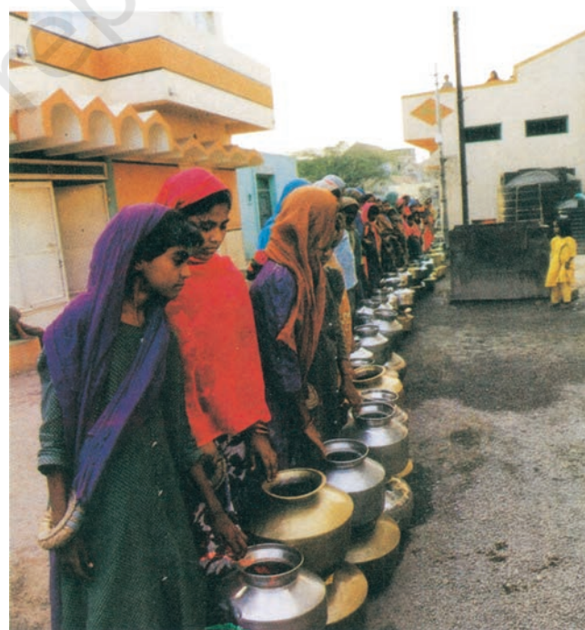
Fig. 3.1: Water Scarcity

एक ओर इजराइल जैसे 25 सेमी. औसत वार्षिक वर्षा वाले देश में जल का कोई अभाव नहीं है तो दूसरी ओर 114 सेमी. औसत वार्षिक वर्षा वाले हमारे देश में प्रति वर्ष किसी भाग में सूखा अवश्य पड़ता है। देश में जल की उपलब्धता और उसके स्वरूप के अनुसार समुचित जलप्रबंधन न होने के कारण ही वर्षा का जल नदी-नालों में तेजी से बहकर समुद्र में चला जाता है जिससे वर्षा के बाद के लगभग नौ महीने देश के लिए पानी की कमी के होते हैं। ये ही मूल कारण हैं देश में जलीय अभाव के, जिसे हम उचित प्रबंधन के द्वारा ही नियंत्रित कर सकते हैं।