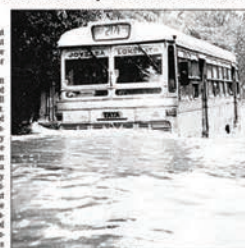
BAREILLY: A bus is stuck in a waterlogged street in Kolkata on Friday

Power blackouts occurred at Bhawanipore, Dum Dum, Thakurga, Behala, New Alipore, Green Park and large parts of south and south-west Kolkata. The post Salt Lake, too, was flooded. Traffic going to the IT hub at Sector V had a tough time resulting through water-logged streets. Assembly was with large water all sculptures at Konark in north Kolkata as rain swept to through the parched roads to wash clay off slabs. "Every artisan has suffered. White-sandstone has badly damaged, colour has been washed off many slabs," said artist Babu Pal. Through efforts were on to use kerosene lamps to dry clay slabs, the artists are already facing cost and time overruns. "If the rain does not subside soon, delivery schedule will go haywire," said Pradyut Pal, an idol maker. The late monsoon outbreak caused by a series of depression came as a dampener for the city residents busy with their Durga Puja preparations. City roads were empty with fewer trains and buses plying on the road.