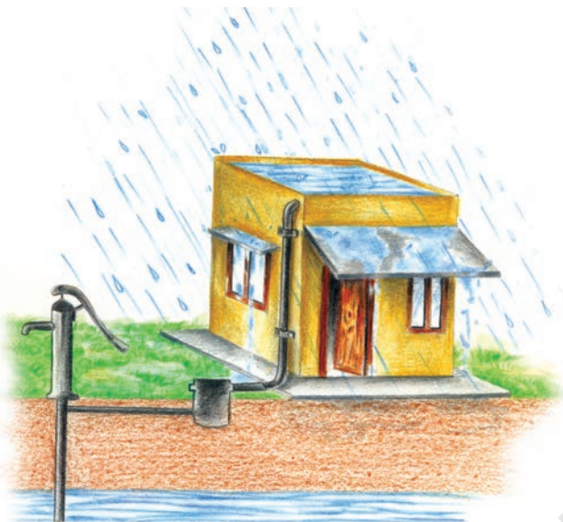
(a) Recharge through Hand Pump

irrigate their fields. In arid and semi-arid regions, agricultural fields were converted into rain fed storage structures that allowed the water to stand and moisten the soil like the 'khadins' in Jaisalmer and 'Johads' in other parts of Rajasthan.