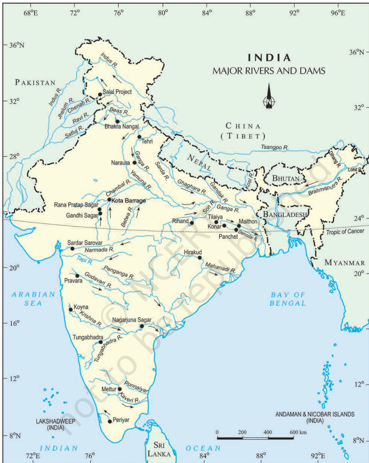
India: Major Rivers and Dams