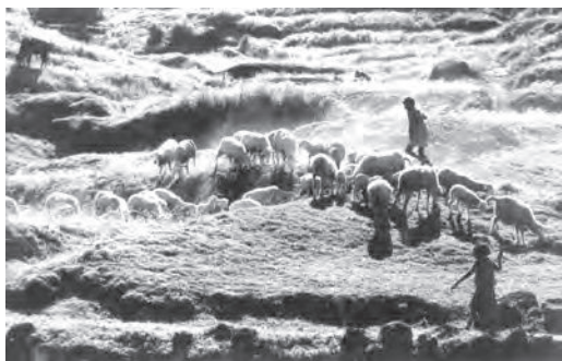
Fig. 5.3 Sheep rearing — an important income augmenting activity in rural areas

followed by others. Other animals which include camels, asses, horses, ponies and mules are in the lowest rung. India had about 303 million cattle, including 110 million buffaloes in 2019. Performance of the Indian dairy sector over the last three decades has been quite impressive. Milk production in the country has increased by about ten times between 1951-2016. This can be attributed mainly to the successful implementation of 'Operation Flood'. It is a system whereby all the farmers can pool their milk produced according to different grading (based on quality), processed and marketed to urban centres through cooperatives. In this system the farmers are assured of a fair price and income from the supply of milk to urban markets. As pointed out earlier Gujarat state is held as a success story in the efficient implementation of milk cooperatives which has been emulated by many states. Gujarat, Madhya Pradesh, Uttar Pradesh, Andhra Pradesh, Maharashtra, Punjab and Rajasthan, are major milk producing states. Meat, eggs, wool and other by-products are