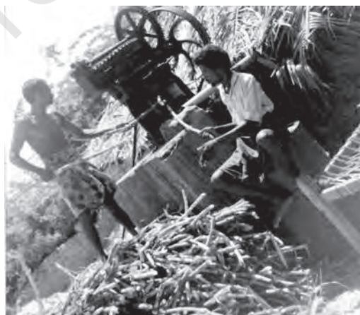
Fig. 5.2 Jaggery making is an allied activity of the farming sector

greater risk in depending exclusively on farming for livelihood. Diversification towards new areas is necessary not only to reduce the risk from agriculture sector but also to provide productive sustainable livelihood options to rural people. Much of the agricultural employment activities are concentrated in the Kharif season. But during the Rabi season, in areas where there are inadequate irrigation facilities, it becomes difficult to find gainful employment. Therefore expansion into other sectors is essential to provide supplementary gainful employment and in realising higher levels of income for rural people to overcome poverty and other tribulations. Hence, there is a need to focus on allied activities, non-farm employment and other emerging alternatives of livelihood, though there are many other options available for providing sustainable livelihoods in rural areas.