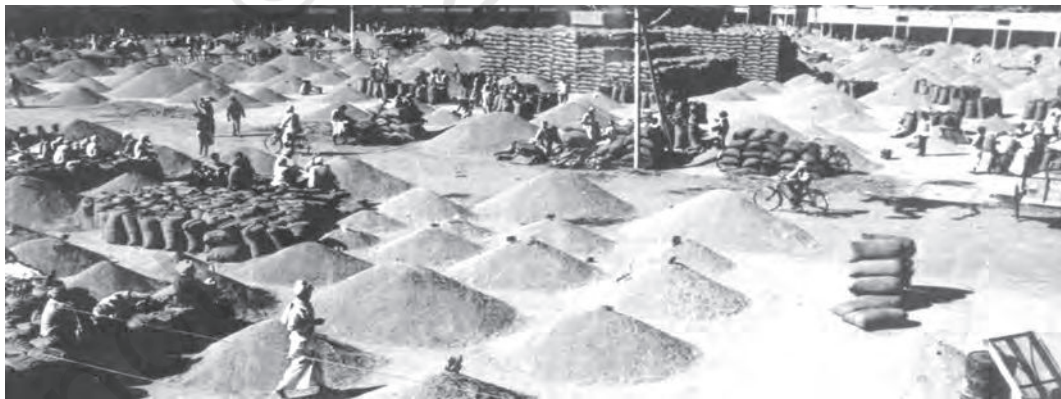
Fig. 5.1 Regulated market yards benefit farmers as well as consumers

All Should Pick The Perfect and Good Diamond