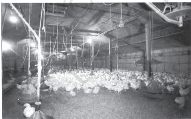
Fig. 5.4 Poultry has the largest share of total livestock in India

Horticulture: Blessed with a varying climate and soil conditions, India has adopted growing of diverse horticultural crops such as fruits, vegetables, tuber crops, flowers, medicinal and aromatic plants, spices and plantation crops. These crops play a vital role in providing food and nutrition, besides addressing employment concerns. Horticulture sector contributes nearly one-third of the value of agriculture output and six per cent of Gross Domestic Product of India. India has emerged as a world leader in producing a variety of fruits like mangoes, bananas, coconuts, cashew nuts and a number of spices and is the second largest producer of fruits and vegetables. Economic condition of many farmers engaged in horticulture has improved and it has become a means of improving livelihood for many unprivileged classes. Flower harvesting, nursery