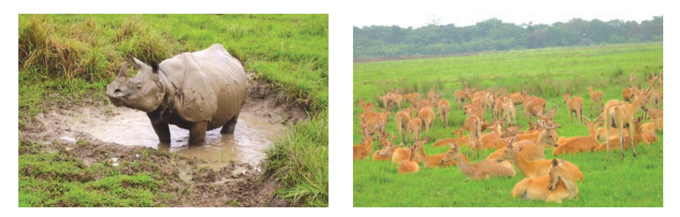
Fig. 2.2: Rhino and deer in Kaziranga National Park

equal importance as a means of preserving biotypes of sizeable magnitude. Corbett National Park in Uttarakhand, Sunderbans National Park in West Bengal, Bandhavgarh National Park in Madhya Pradesh, Sariska Wildlife Sanctuary in Rajasthan, Manas Tiger Reserve in Assam and Periyar Tiger Reserve in Kerala are some of the tiger reserves of India.