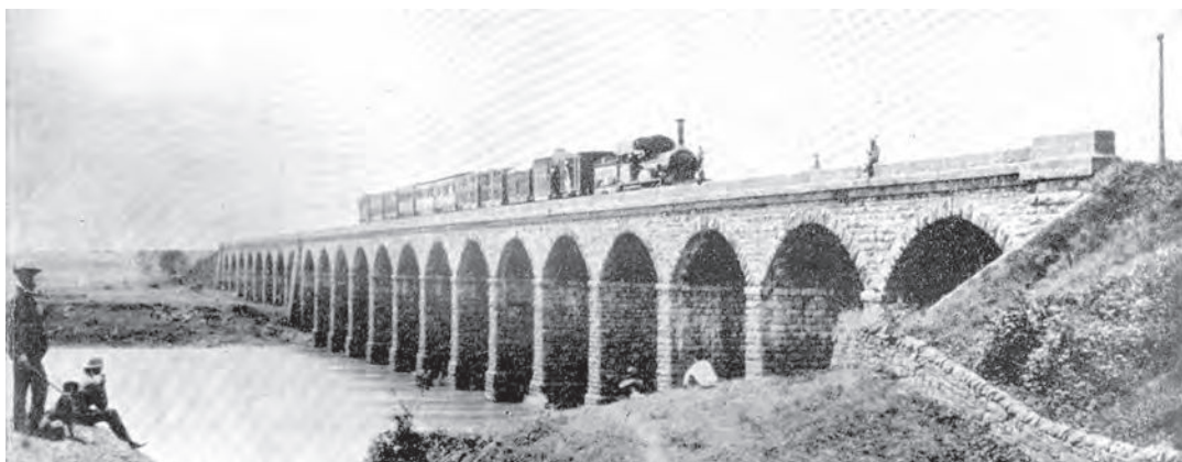
Fig. 1.4 First Railway Bridge linking Bombay with Thane, 1854

Indian people gained owing to the introduction of the railways, were thus outweighed by the country's huge economic loss.