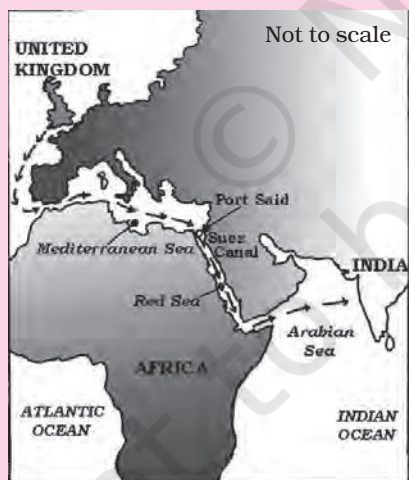
Fig.1.2 Suez Canal: Used as highway between India and Britain

Various details about the population of British India were first collected through a census in 1881. Though suffering from certain limitations, it revealed the unevenness in India's population growth. Subsequently,