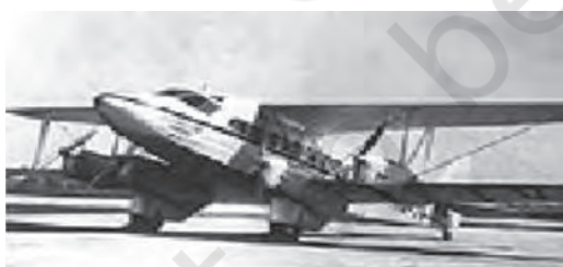
Fig.1.5 Tata Airlines, a division of Tata and Sons, was established in 1932 inaugurating the aviation sector in India

➤ There is a perception still going around that in many ways the British administration in India was quite beneficial. This perception needs an informed debate. How would you look at this perception? Argue this out in your class—'Was the British Raj good for India'?