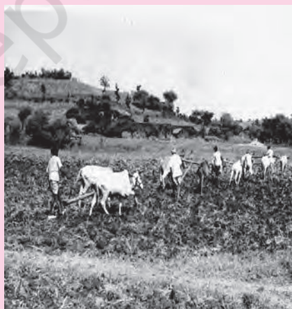
Fig. 1.1 India's agricultural stagnation under the British colonial rule

The French traveller, Bernier, described seventeenth century Bengal in the following way: "The knowledge I have acquired of Bengal in two visits inclines me to believe that it is richer than Egypt. It exports, in abundance, cottons and silks, rice, sugar and butter. It produces amply — for its own consumption — wheat, vegetables, grains, fowls, ducks and geese. It has immense herds of pigs and flocks of sheep and goats. Fish of every kind it has in profusion. From rajmahal to the sea is an endless number of canals, cut in bygone ages from the Ganges by immense labour for navigation and irrigation."