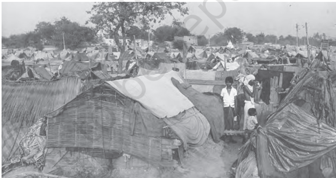
Fig. 1.3 A large section of India's population did not have basic needs such as housing

During the colonial period, the occupational structure of India, i.e., distribution of working persons across different industries and sectors , showed little sign of change. The agricultural sector accounted for